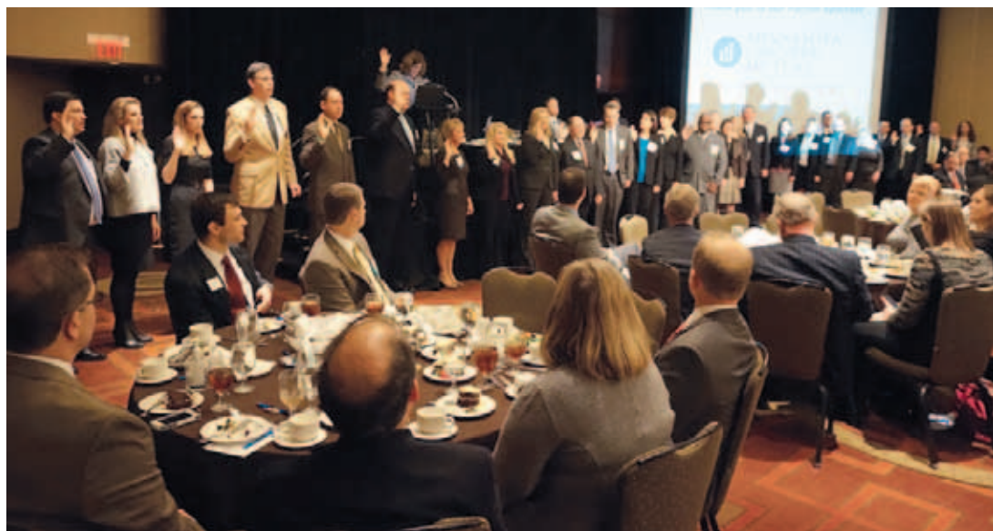
The 2015 Indianapolis Bar Association and Foundation Boards of Directors were installed at the Installation Luncheon at the Hyatt Indianapolis on Jan. 29. Over 200 people attended to show their support.